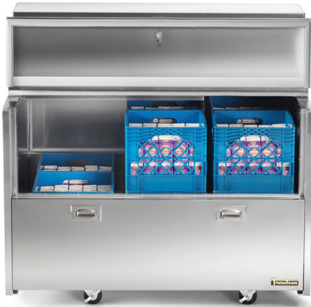
Model Shown - RMC49D4