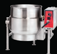
2/3 Jacketed Tilting Kettles

With the Vulcan line of quality steam equipment, you'll have a team that's tough, durable, top quality and high performance. Our steamers, convection steamers, kettles, high-efficiency steam boilers and braising pans fit your needs, stay in top shape for the long-run and offer innovative features for your fast-paced operation.