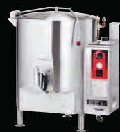
Fully Jacketed Kettles