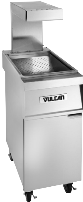
Frymate VX15 shown with optional ThermoGlo™ Food Warmer