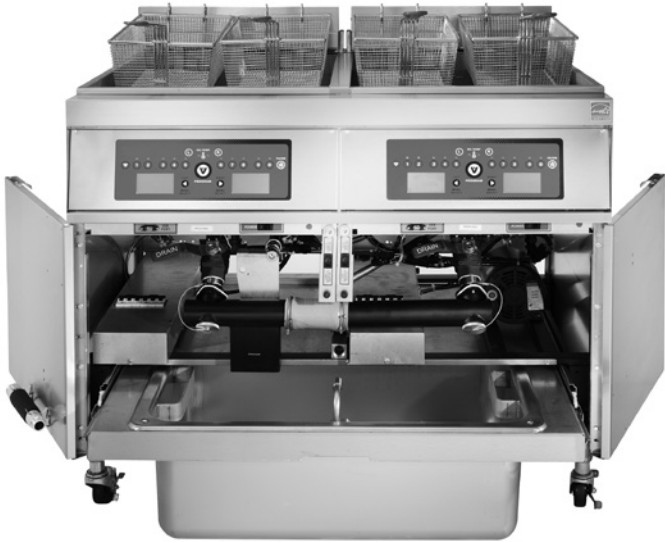
Model 2ER85CF Shown on casters (Accessory)