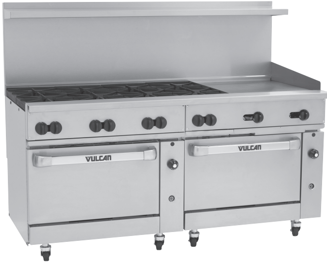
Model 72SC-8B-24G-N (shown with optional casters)