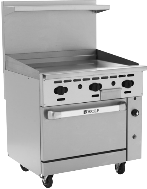
Model C36S-36GN (shown with optional casters)