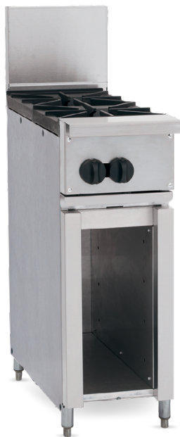
Model 12-2BN (shown on adjustable 6" legs)