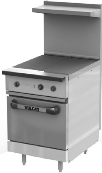
Model EV24S-2HT208 shown with adjustable legs