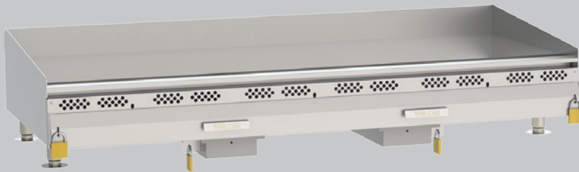
972RX Shown with lockable front panel and grease drawers to protect controls and components.