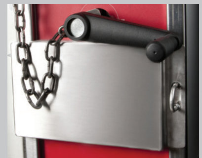
Heavy gauge chain secures the crank handle.