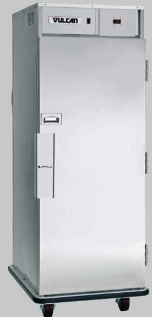
CBFT Shown with correctional package.