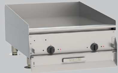
HEG24E Shown with drop-down lockable cover.