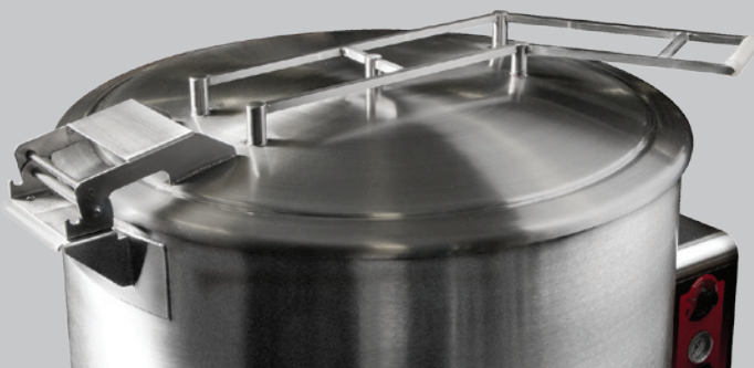
Heavy duty 14 gauge cover.