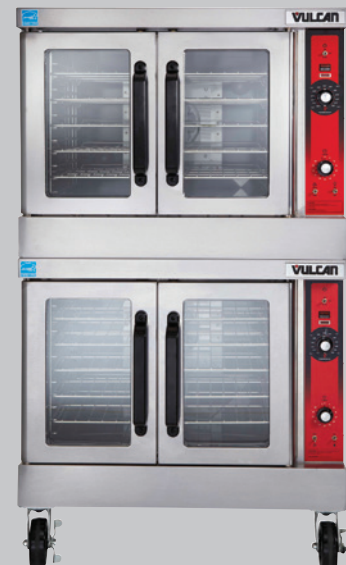
VC44G Shown without correctional package.