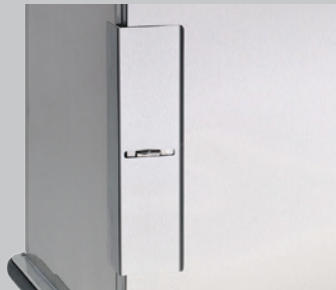
12-gauge locking transport latch.