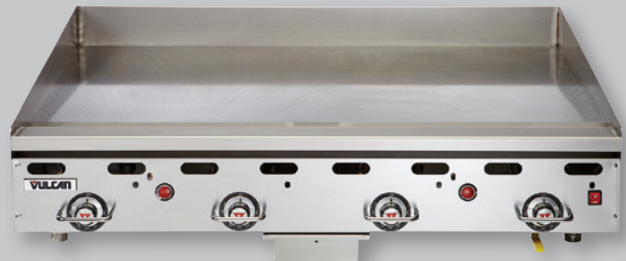
948RX with shut-off valve

Select between a 24" or 30" deep griddle plate to meet operational needs.