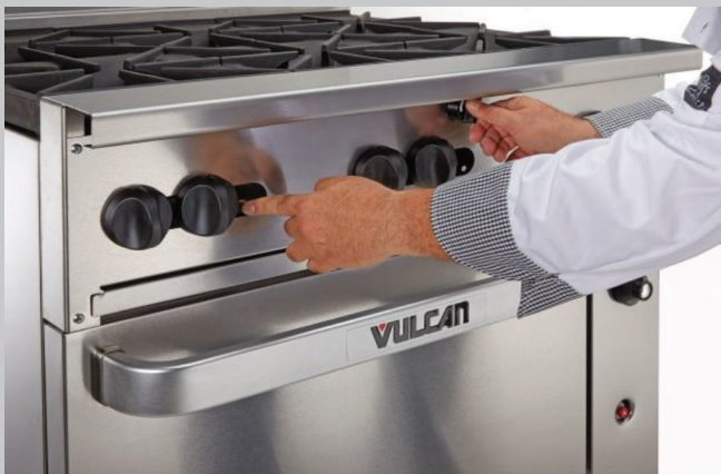
Press-n-Click Piezo Ignition

→ Flexible platforms available to meet your menu requirements.